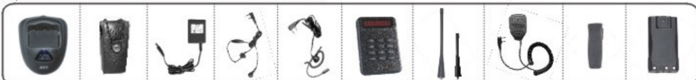
Standard Charger TDC-29 Rapid Charger TDC-28